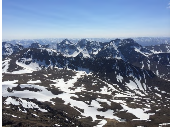
Summit view just east of Anchorage

There is a lot of growing excitement about our 50 th Anniversary Annual Banquet just around the corner. Please log in to the website soon to purchase your banquet and raffle tickets online.