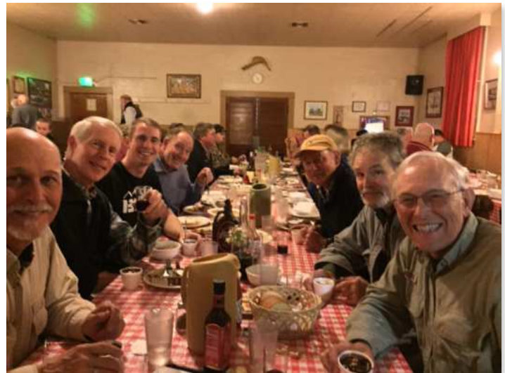
Woolgrower's Restaurant regulars