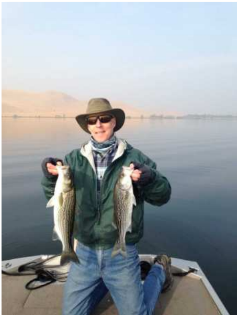
O'Neill forebay schoolie stripers

Sunday Dinner: Our club tradition is to meet for dinner the first night at the Woolgrower's Restaurant in Los Banos – 6:00 p.m. This is a family style, Basque joint that is a unique and fun place. It's almost worth the trip to eat here.