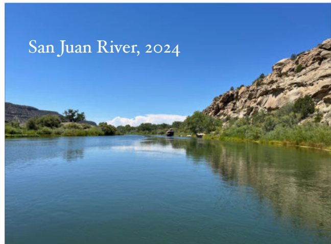
San Juan River, 2024